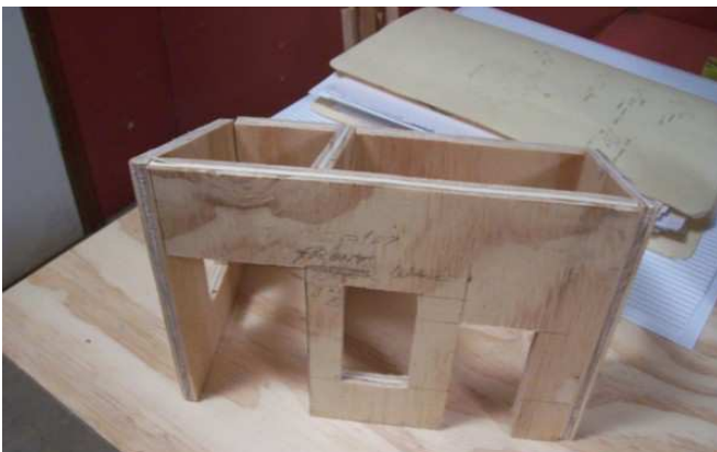
The shell is made of 8mm plywood.