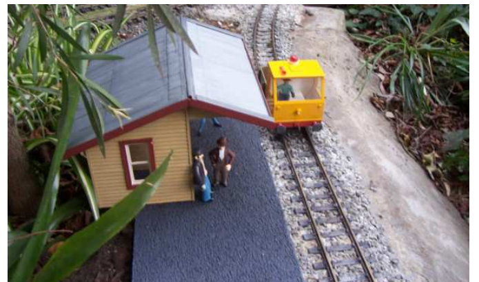
Corrugated roofing sheets glued on.