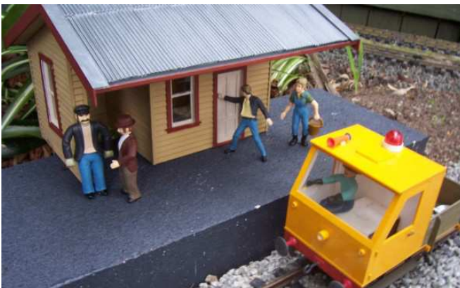
Profiled styrene wall cladding is glued to plywood.