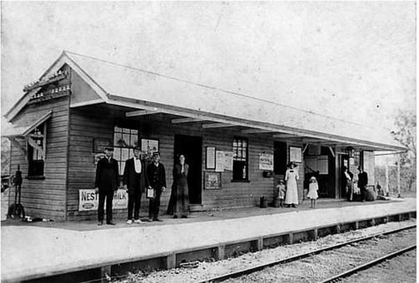
The model is a much foreshortened version of this style of QLD railway station building.